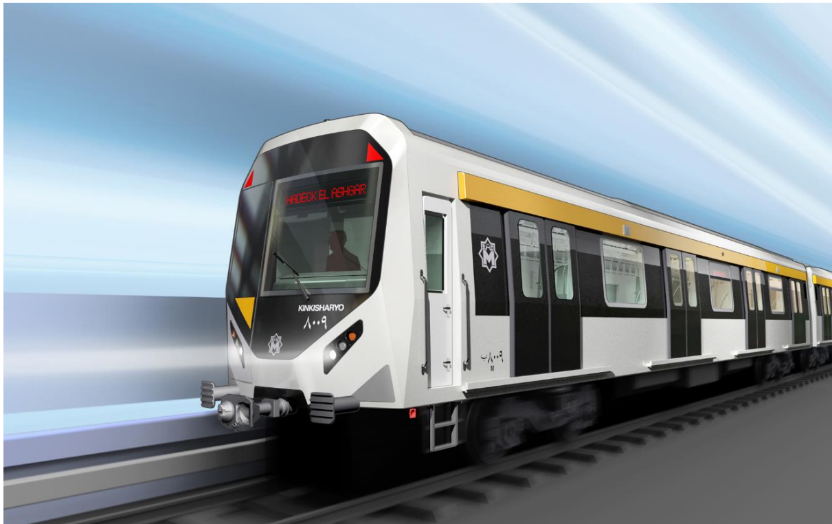
Image of Train